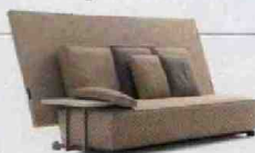
The Oh, It Rains! outdoor sofa, Starck's first collaboration with B&B Italia. bebitalia.com