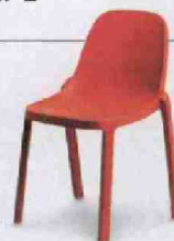
The designer's Emeco Broom chair is made from reclaimed industrial wood and polypropylene dust. dwr.com