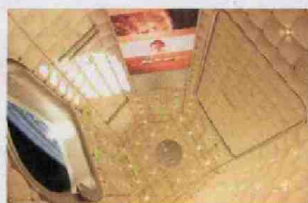
A rendering of a Starck-designed Axiom Space module for commercial space tourism.