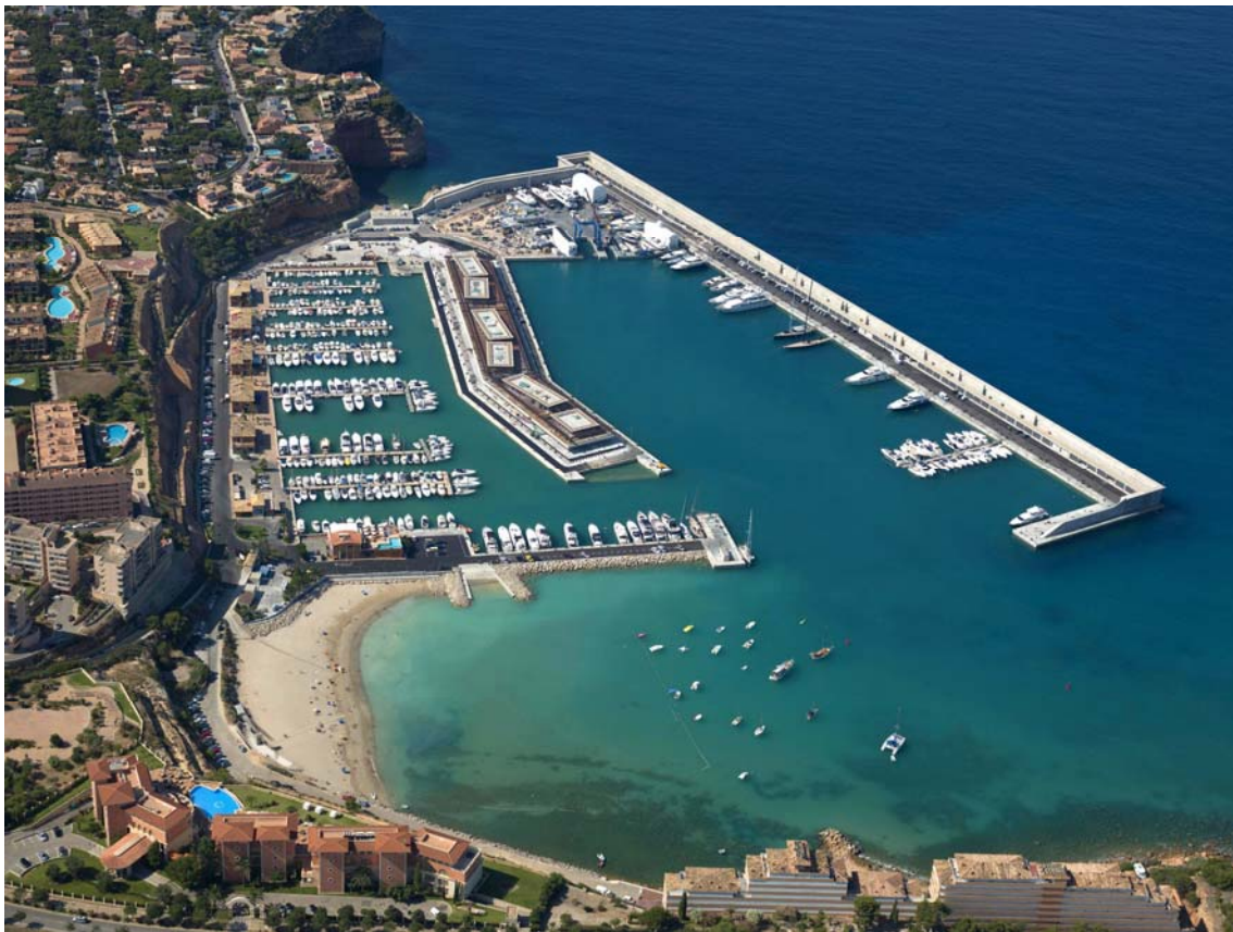
Aerial view of Port Adriano

BOOT DÜSSELDORF 2012 21-29 January Halle 6 stand B61 (Sunseeker stand)