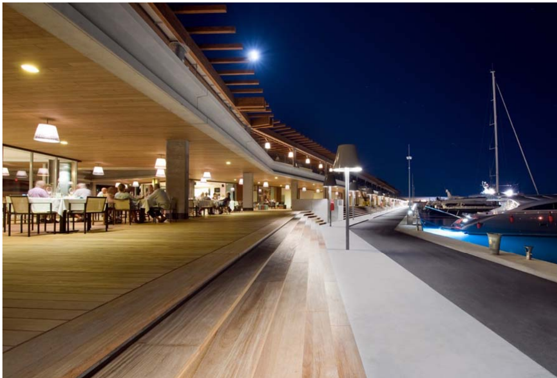
Shopping area designed by Philippe Starck

Port Adriano has a shopping area with 40 shops covering 4,000m 2 , one of the great attractions of the new marina. Prestigious Spanish and foreign sailing and fashion firms, restaurants and service companies will open to the public this summer.